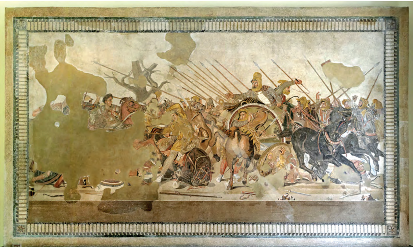
Mosaic from the House of the Faun, Pompeii